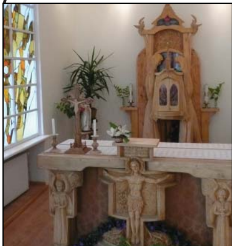
St. Clares' Hospice in Utena, Lithuania