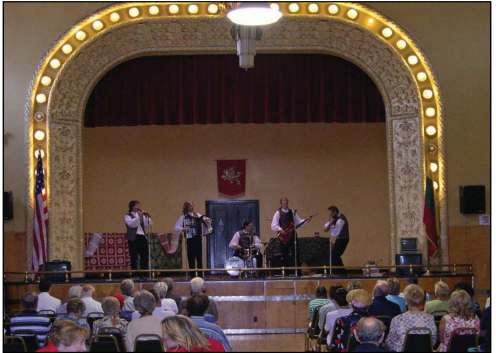
Aitvaras performs for members of the Lithuanian Citizens' Society at the Lithuanian Hall in the South Side on August 18.

Lively music, dancing, and enthusiastic clapping of hands occurred during the August 18 concert of Aitvaras, a Lithuanian music ensemble who performed at the Lithuanian Hall. The independent professional music group performed Lithuanian folk songs and instrumental pieces that included the violin, accordion, bass guitar, drums, reed-pipe, mouthorgan, flutes, and horns. The members of the band drew their audience into a whirlwind of their performance, and what fun it was!