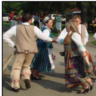
The Neris Dancers performed at last year's Jonines Picnic.

The Annual Jonines Day Celebration will be held on Saturday, June 20, at the Lithuanian Country Club in Jefferson Hills from 3:00 p.m. until dark. The