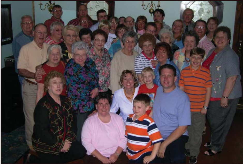
The Knights of Lithuania gathered for a dinner at the Baltimore House on May 19.