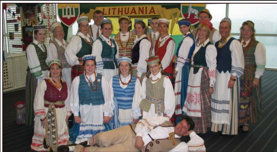
The Neris Dancers of Pittsburgh pose in front of the cultural display booth at the 51st Annual Pittsburgh Folk Festival.

The cultural display booth featured an outline map of Lithuania showing the location of ten must-see sites. Photos of the sites were displayed along with a brief description. Artifacts were also on display which included amber jewelry, pottery, and dolls dressed in full costume.